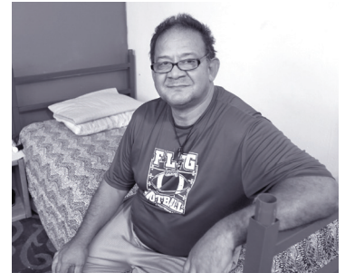
31,240 nights of shelter

For men, women and children who might otherwise have been sleeping in cars or on the streets of the greater Los Angeles area, the Mission provided 31,240 nights of safe shelter.