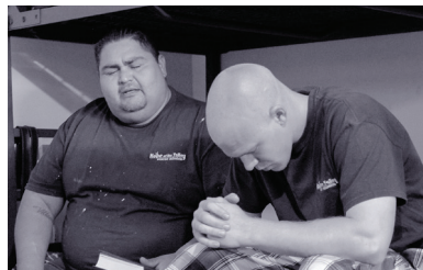
Returning to useful, productive lives!

With 2 thrift stores in the San Fernando Valley and 1 in the Santa Clarita Valley, there are a lot of great deals to be found. But most importantly, every time you shop at one of our Thrift Stores, you're supporting work therapy for our long-term recovery program residents - and our programs that provide food, shelter and resources for men, women and children experiencing homelessness.