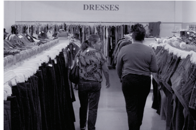
Shopping to save lives!

We hope these photos are reminders of the life-saving, life-changing work you made possible during the past year.