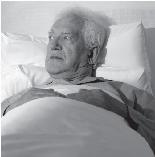
Here’s how your gifts are changing lives: For people in our community just released from local hospitals, our Recuperative Care Center offers extended shelter & care.

Along with taking in homeless individuals, our Center includes veteran services, a mental health clinic and a community health clinic – all open and available to the public. Men, women and children who desperately need a place to stay are also welcome to stay in our emergency shelter.